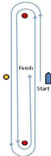
Figure 2 – Course B

For Course B on legs 2 & 3 the Start / Finish marks are not marks of the course. (The start / finish line is open.)