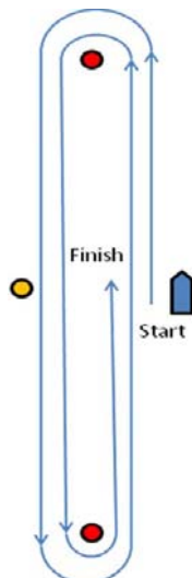
Figure 2 – Course B

For Course B on legs 2 & 3 the Start / Finish marks are not marks of the course. (The start / finish line is open.)