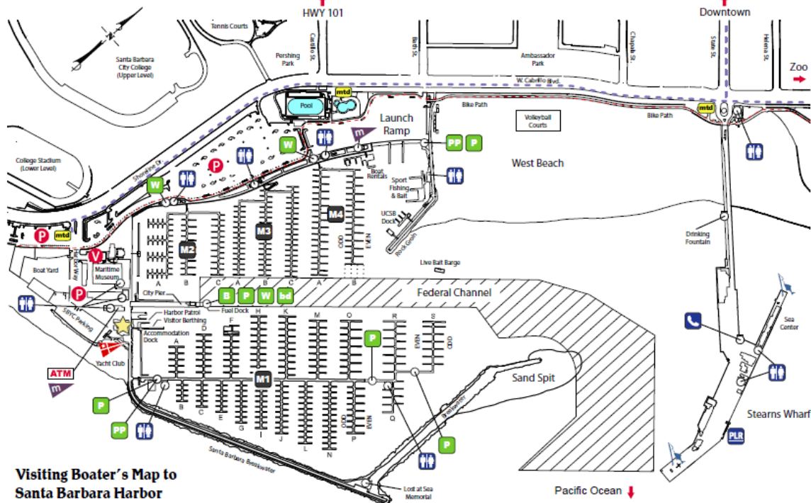
Visiting Boater's Map to Santa Barbara Harbor