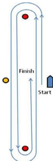
Figure 2 – Course B

For Course B on legs 2 & 3 the Start / Finish marks are not marks of the course. (The start / finish line is open.)